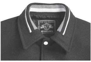
Vertical knit collar .....$14.00