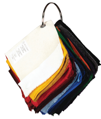
WOOL 226906 - $25.00