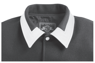
Leather collar, wool insert...$14.00