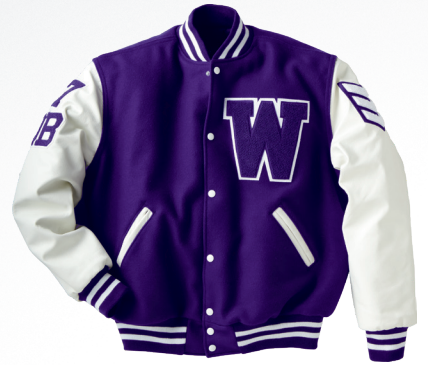
VARSITY JACKET 224183 – 40 In-Stock Colors 224683 Tall – 6 In-Stock Colors