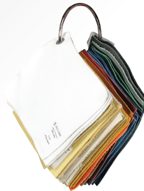
LEATHER 226905 - $25.00