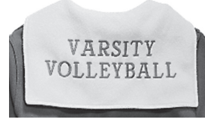
Sailor collar .....$12.00