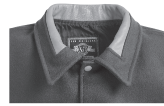
Wool collar, leather insert... $14.00