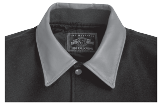
3-piece Byron collar ..... $16.00