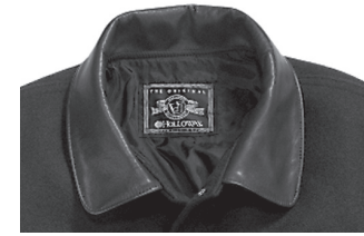
Leather Byron collar ..... $14.00