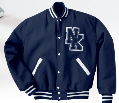
LETTERMAN JACKET 224182 – 9 In-Stock Colors