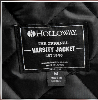
Classic Holloway Label