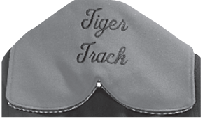
Shallow scallop self-material attached zipper hood-forming collar.....$15.00

Additional Cost (Wool Only) * When hood reverses to White or Yellow, Canyon™ Fleece will be used: all other colors will be wool.