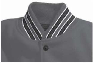
Stand-up knit collar .....No charge