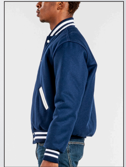
Bulky with excess fabric at waist.