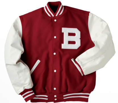
AWARD JACKET 224181 – 6 In-Stock Colors