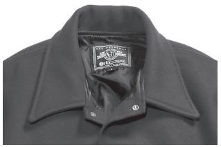
Wool Byron collar .....No charge