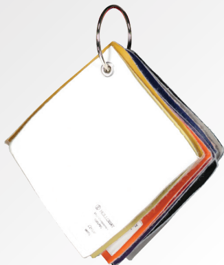
VINYL 226904 - $25.00

DURABLE VINYL, CLASSIC LEATHER, AND SOFT WOOL SWATCH RINGS