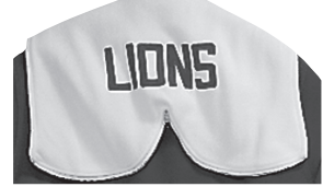
Deep scallop self-material attached zipper hood-forming collar .....$15.00