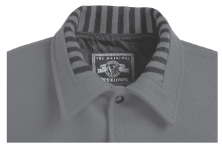
Horizontal knit collar ..... $14.00