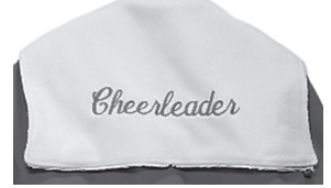
Straight across zipper hood .....$15.00